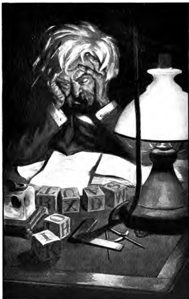
"MY RE-TRANSLATION FROM THE FRENCH"